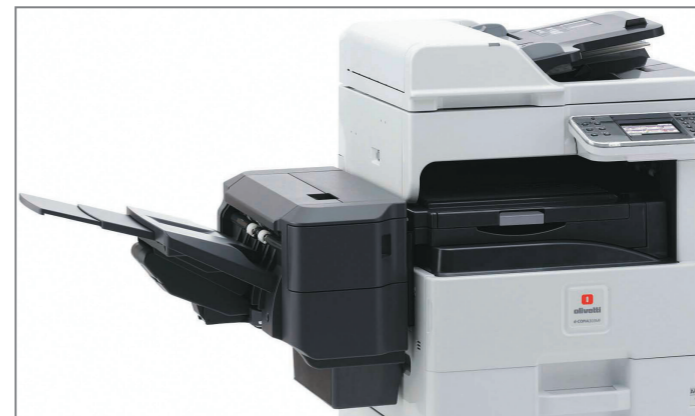
HANGING FINISHER (optional)

The d-Copia 253MF plus and 303MF plus are equipped with a standard 50-page A3 duplex automatic document feed , a feature normally available only as an option. This means professional performance levels are already delivered by the basic configurations, which also include advanced protocols like IPsec, SSL and IPv6 for data security in network environments . The system configuration can be enhanced with paper decks providing one or two additional 500-sheet trays, and a practical 500-sheet finisher/stapler which mounts on the left side of the machine. The system administrator can regulate access to the d-Copia 253MF plus and 303MF plus with authentication of user logins and passwords, a procedure that can be facilitated by contactless badge readers compatible with the main industry standards (Mifare, Legic, Multi ISO, and others). All the options available for the d-Copia 253MF plus